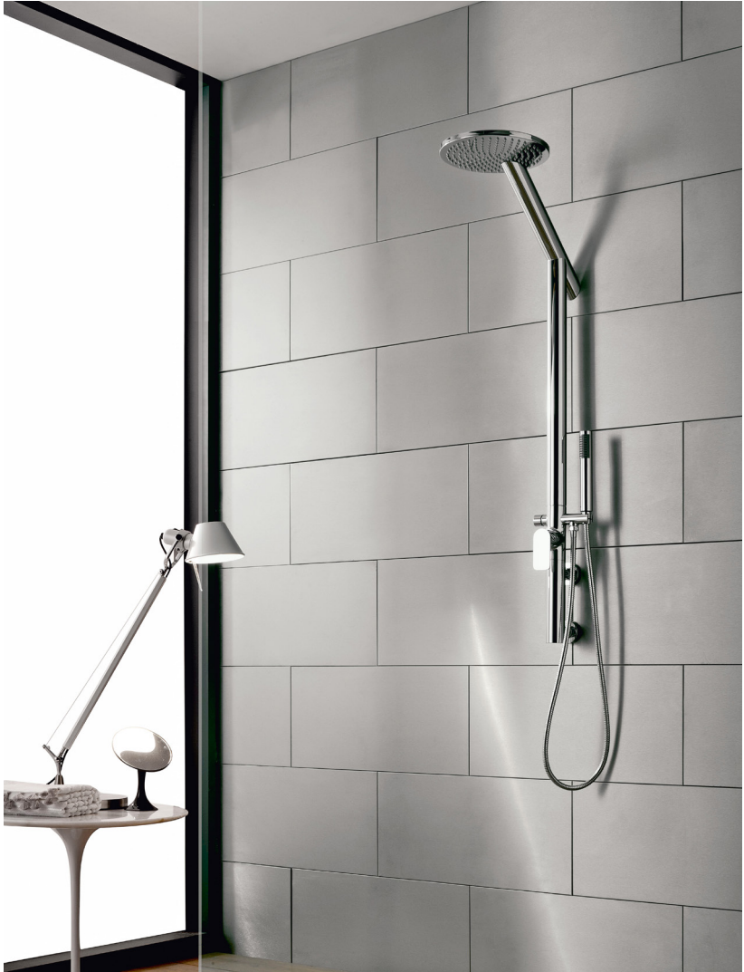
Graff Sento Column Shower