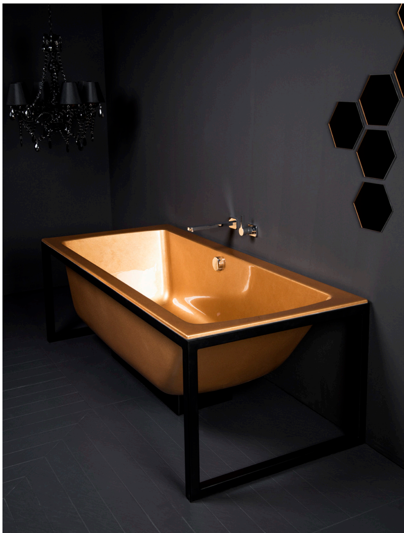
Galatea MOMA bath