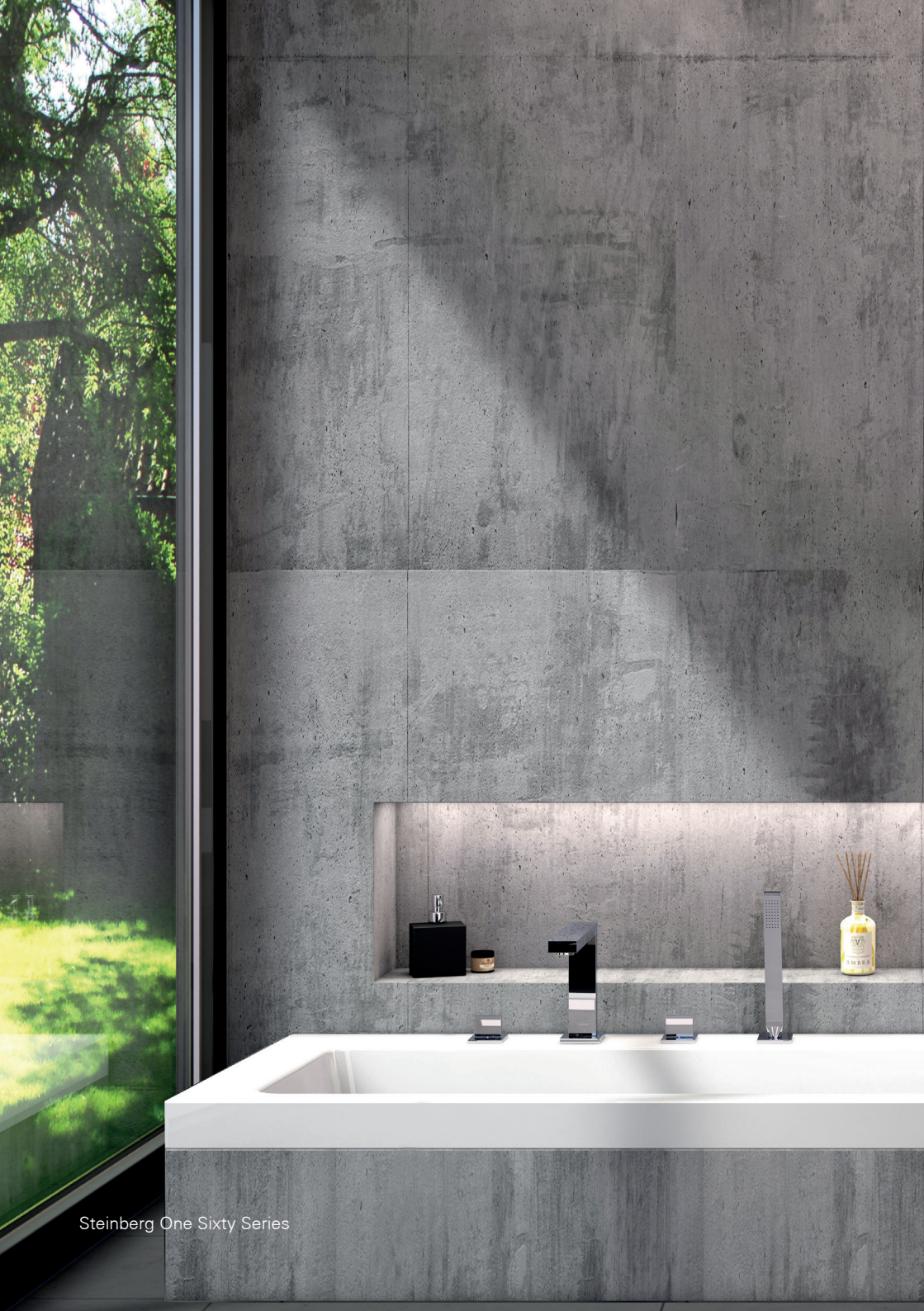
Steinberg One Sixty Series