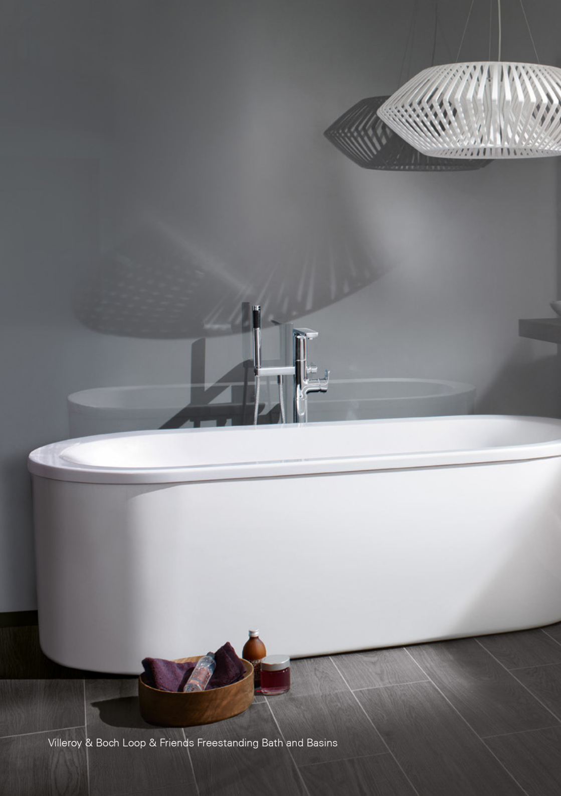
Villeroy & Boch Loop & Friends Freestanding Bath and Basins