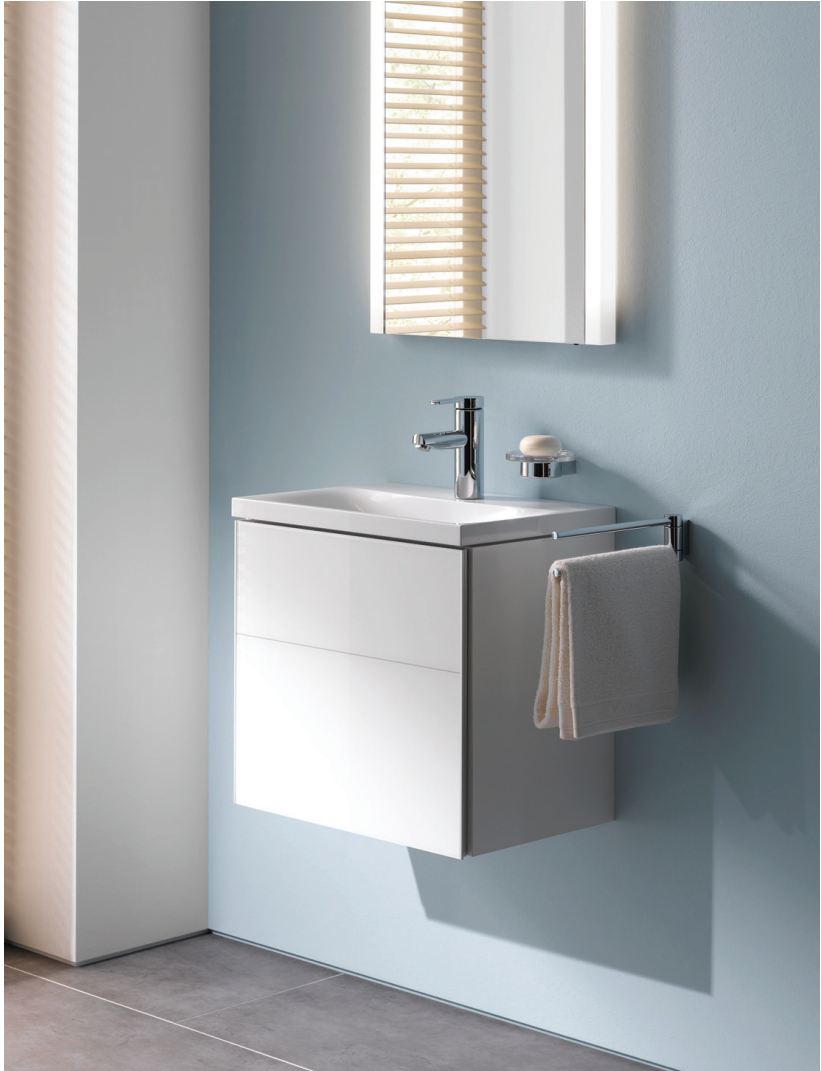
Keuco Royal Reflex