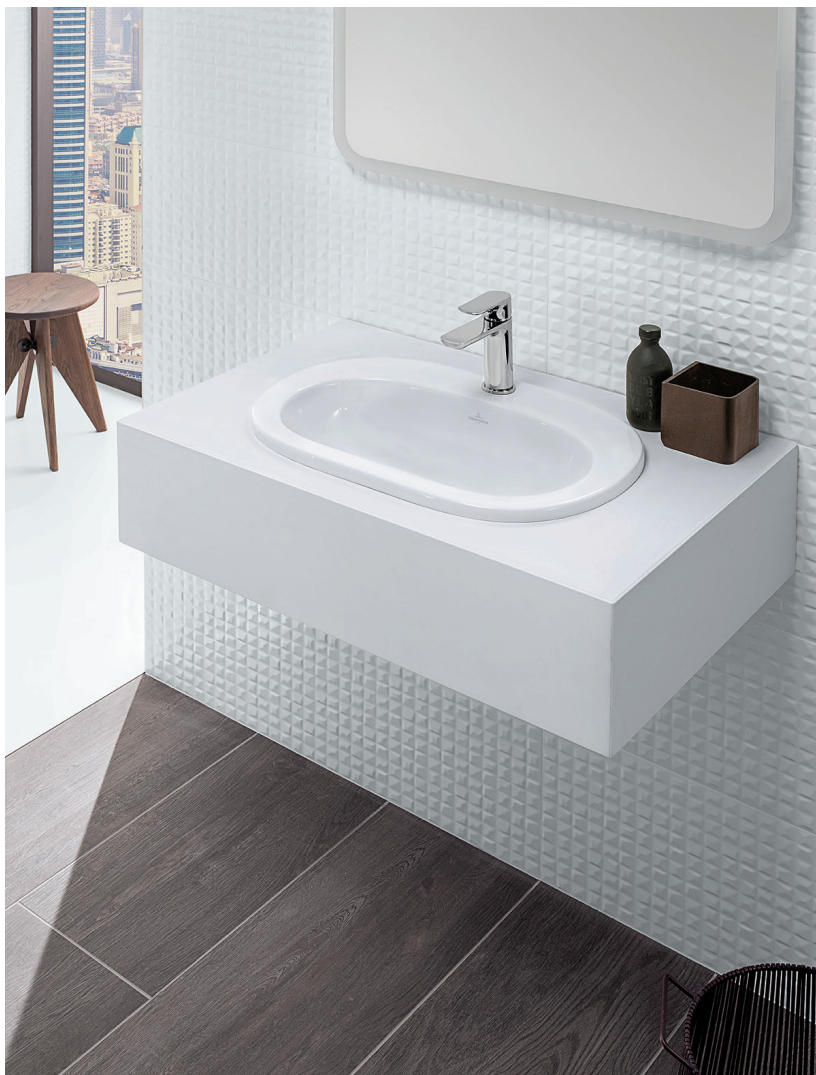
Villeroy & Boch O.Novo