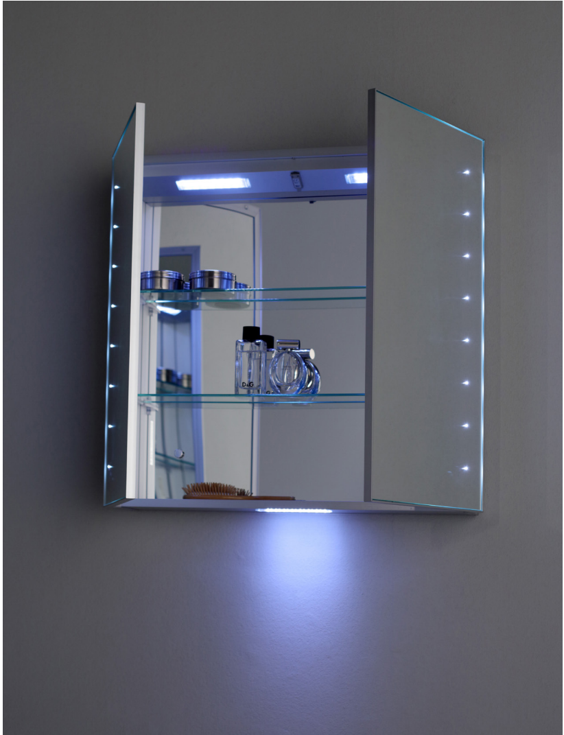
Vanita & Casa Vega Mirror