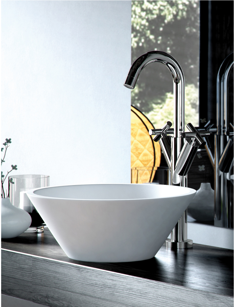
Fima Maxima Basin Mixer