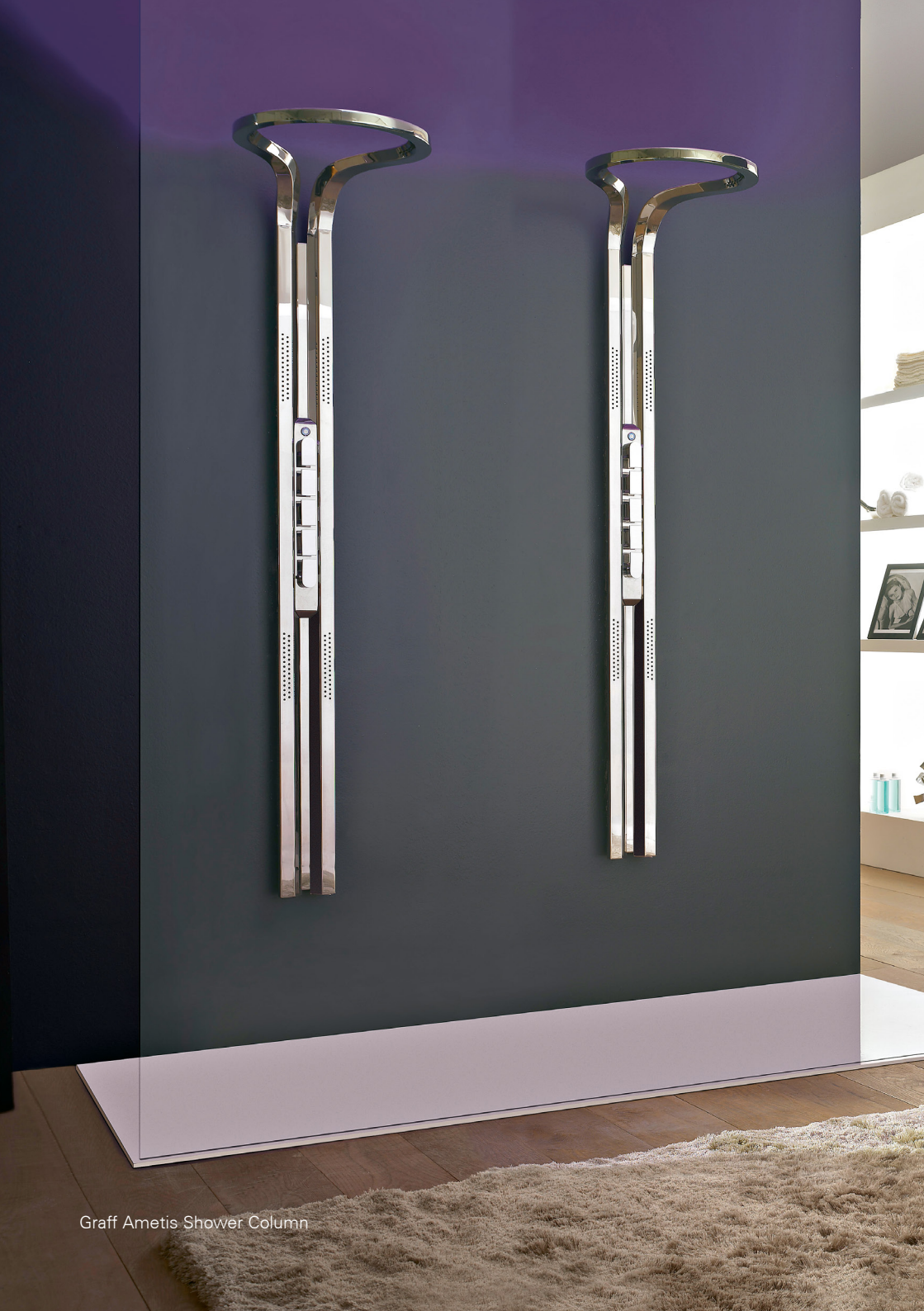
Graff Ametis Shower Column