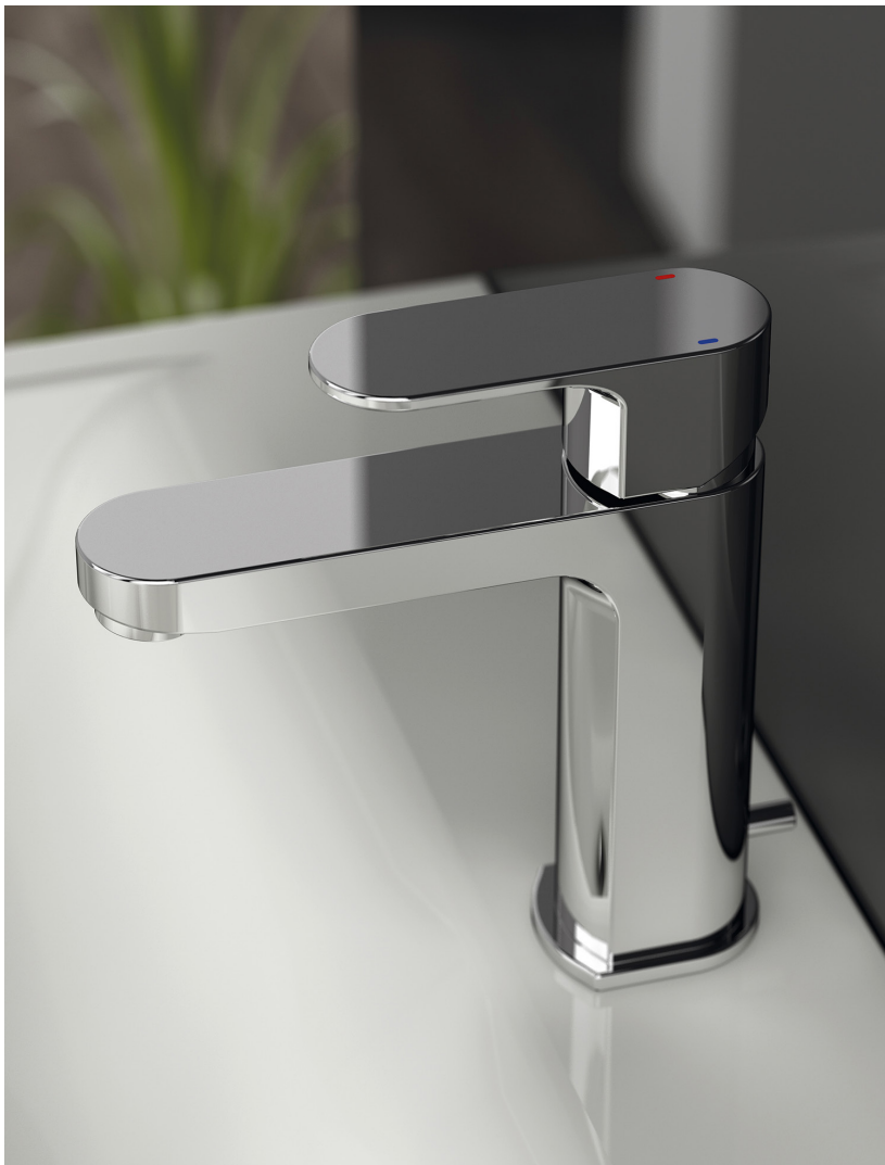
Steinberg Triple One Basin Mixer