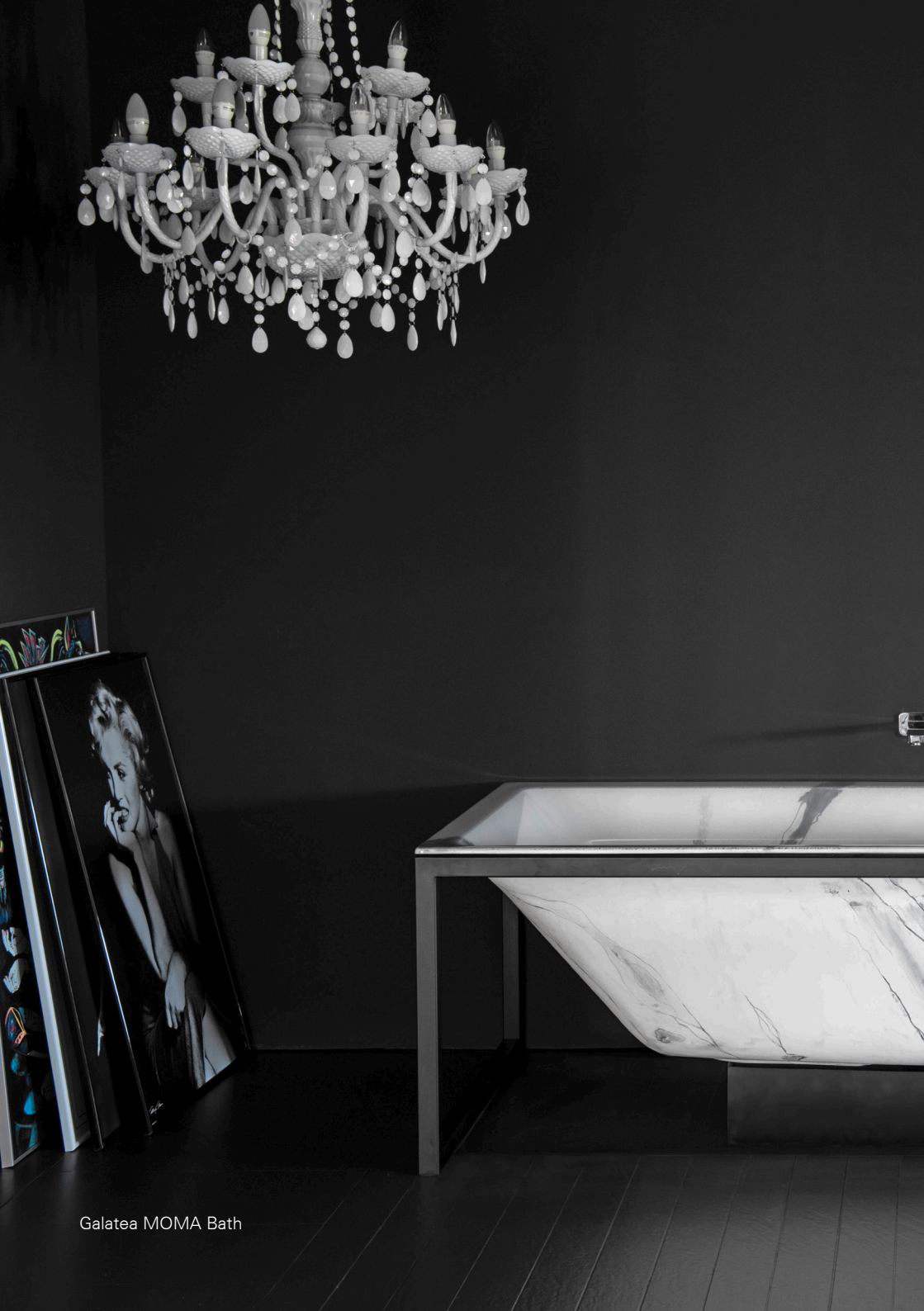
Galatea MOMA Bath