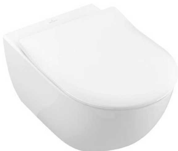
Optional: Slim Seat